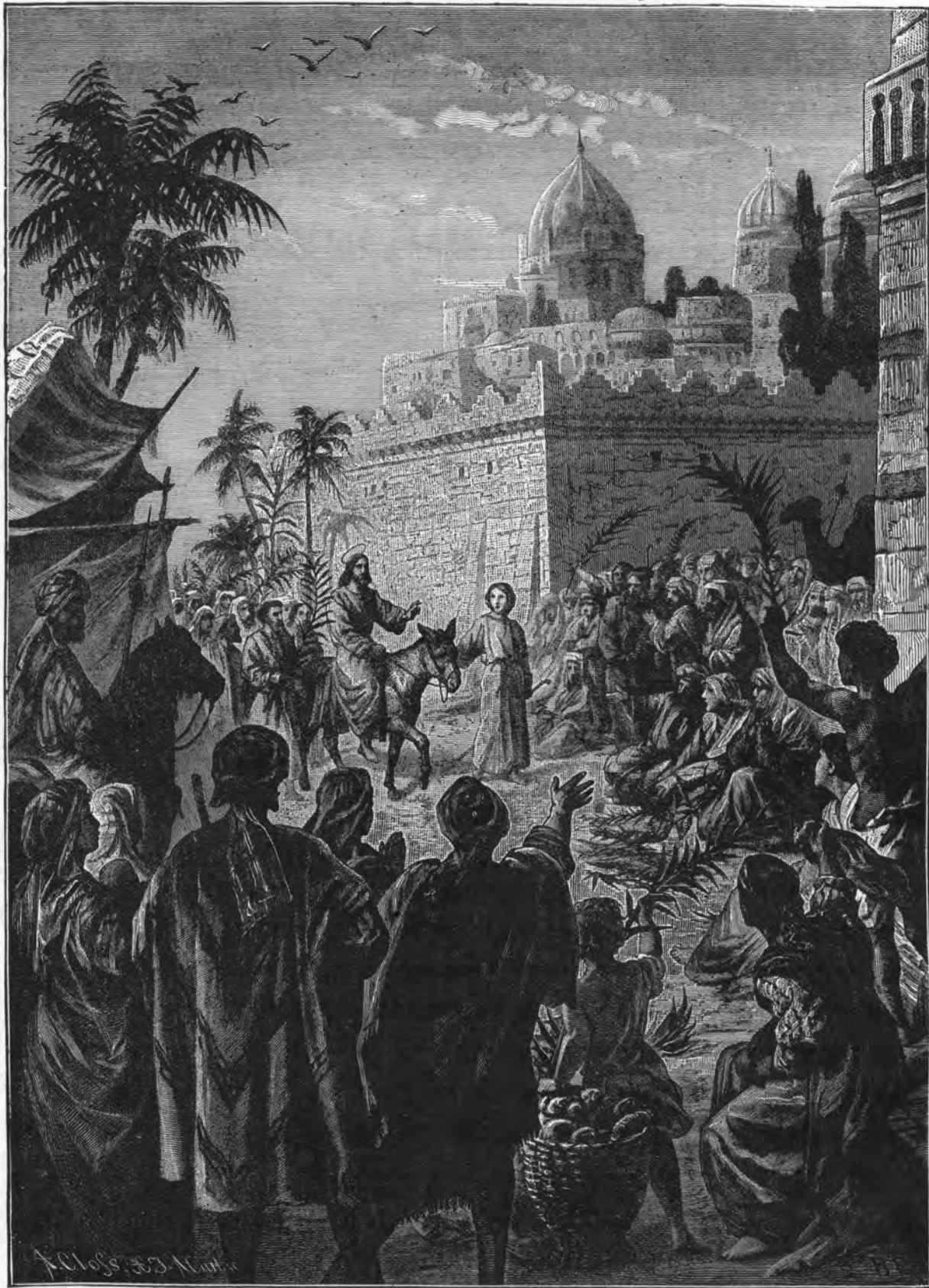
Triumphal Entry of Jesus into Jerusalem.